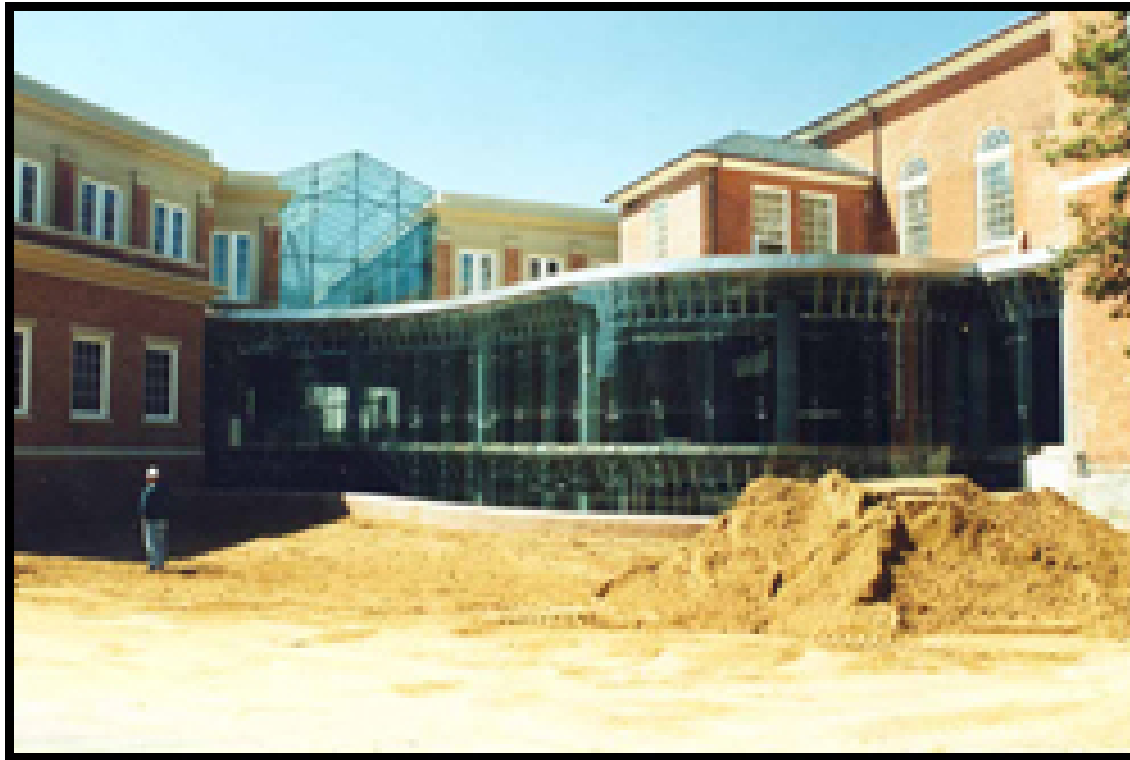
Anne Arundel County Courthouse